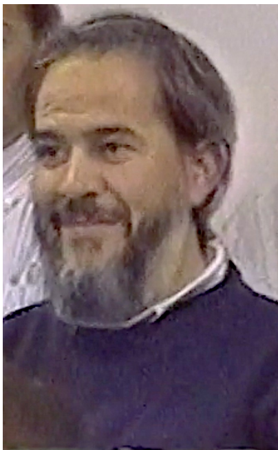
Image 1 -- Screenshot from MPS902, at 26.26