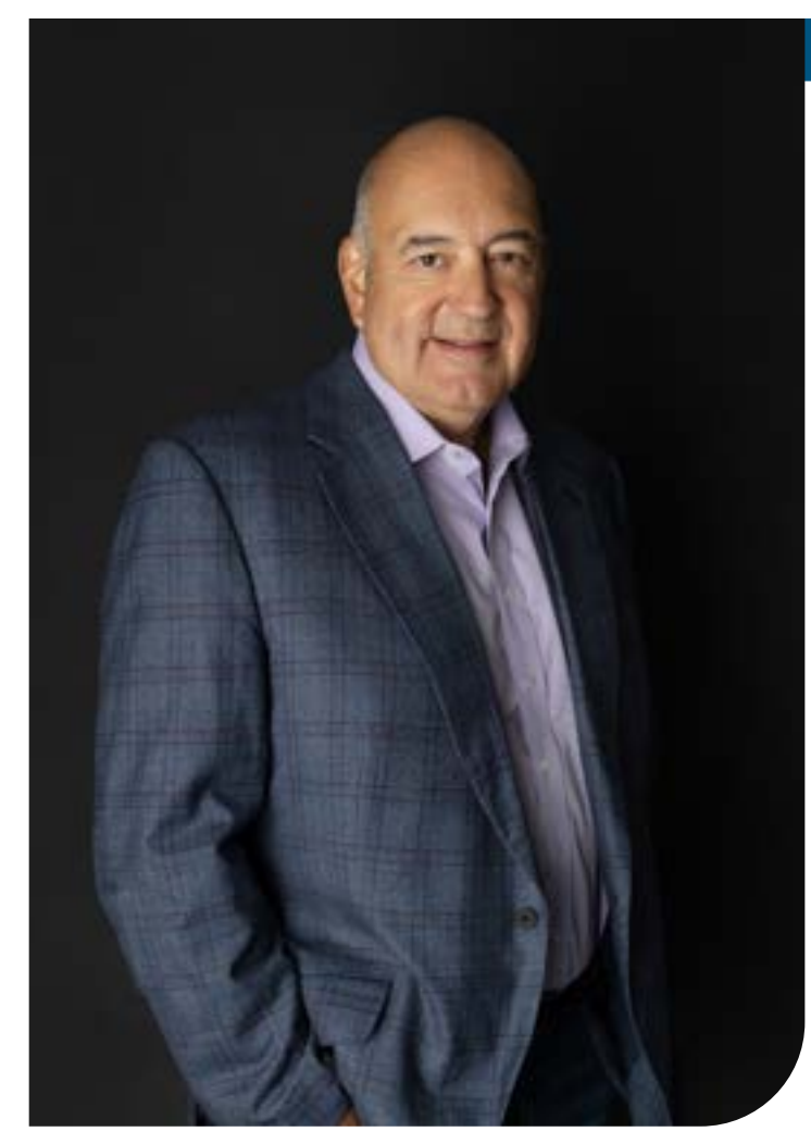
Licensed in MA, MN, NY, RI, SC