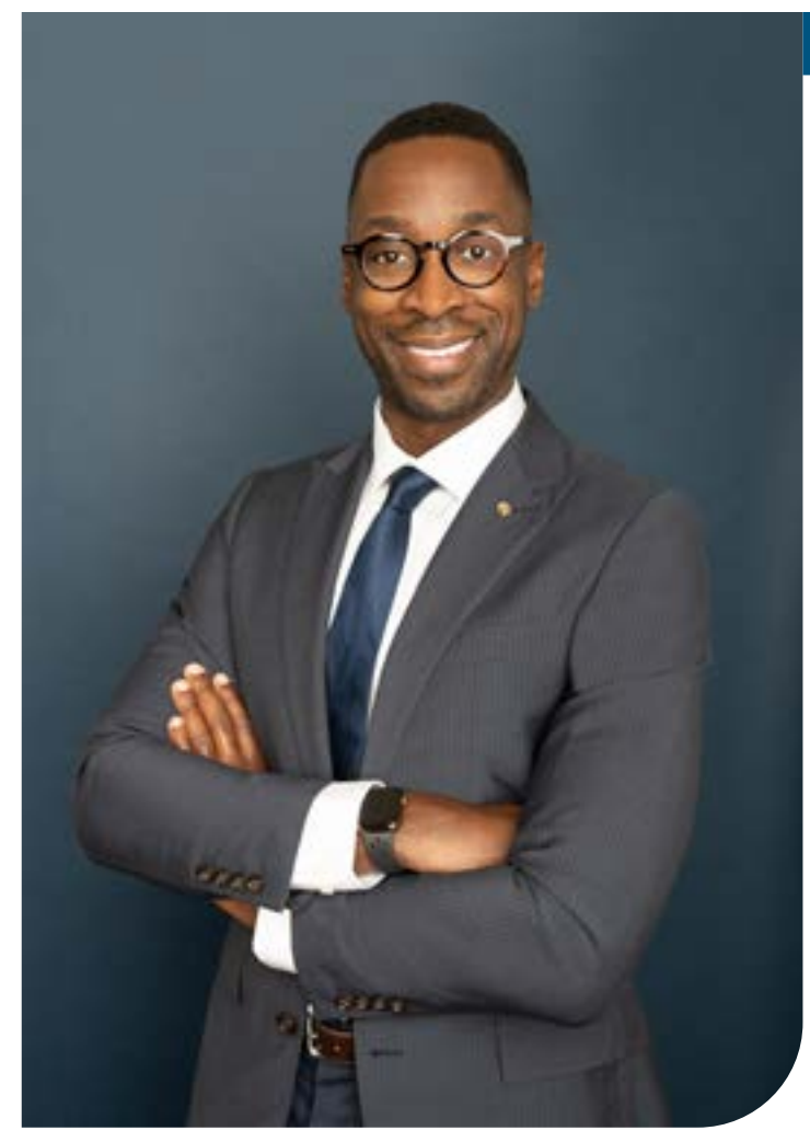
Licensed in SC, DC

Aviation litigation is complex and time-consuming, often leaving families lost, confused, and frustrated. Understanding how to represent surviving families of an aviation disasterhow to be there for them and help them get answers is critical to what we do."